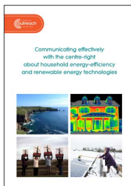
Communicating effectively with the centre-right about household energy-efficiency and renewable energy technologies March 2016