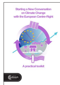
Starting a new conversation on climate change with the European centre-right January 2015